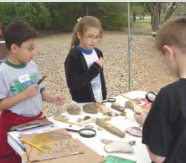
Elementary students in the Challenge program studied archaeology for 12-13 weeks, culminating in an archaeological dig at the Outdoor Learning Center. Teachers used authentic, local "artifacts" found in the Katy area for the young scientists to discover.

More than 900 Limited English-Proficient students entering kindergarten and first grade got a jump on their English skills during an intensive five-week summer school program in 2006. Sixty-three teachers guided the students in immersion activities such as shared reading and writing, vocabulary, and phonics awareness and understanding. Cooperative and learning activities were based on students' language proficiency as measured by assessments given during the prior spring. Activities in the summer program focus on language development through listening, speaking, reading and writing English.