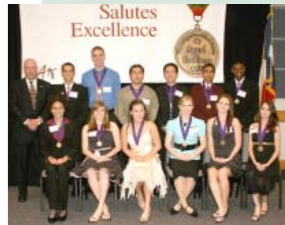
For the first time, top graduates from Morton Ranch High School joined the ranks of students honored with the district's Student Excellence Awards. 12 stand-out seniors from each high school and 2 from Miller Career and Technology Center, along with their parents and most outstanding teachers, are special guests at an annual dinner sponsored by the Communications Department.